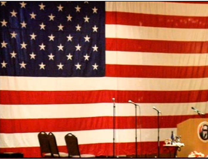
Our Flag was the main focus of the room

Our Salute was followed with live music by the Moonlighters led by Lee Skiles.