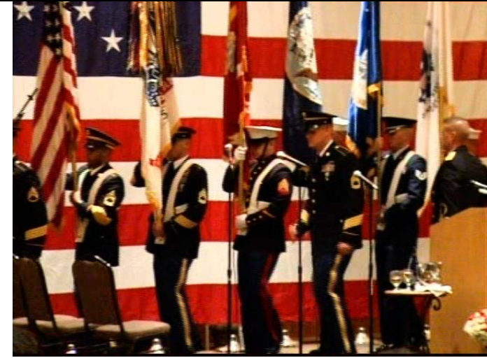
The Colors are retired.