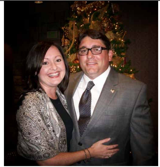
Iraq USMC veteran and his wife.