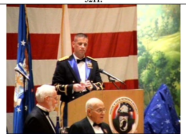
Military Toasts for all branches, and our salutees.

48 Members of the 135<sup>th</sup> Army Band entertained us during dinner.