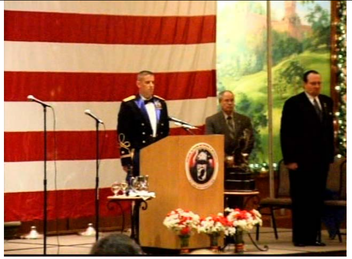
The Salute ends.