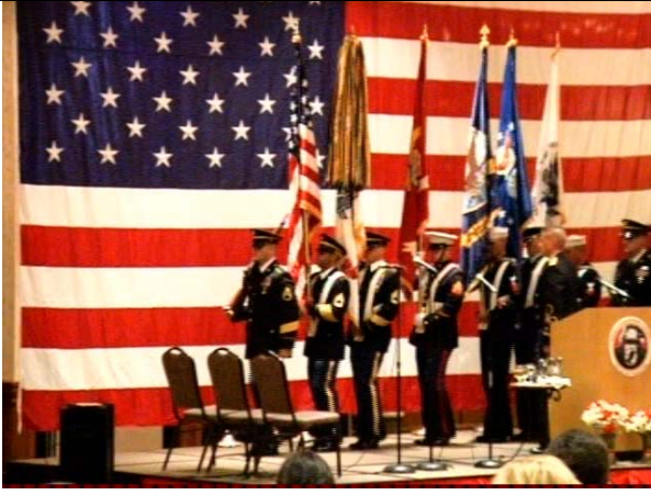
Joint Services Color Guard, FLW