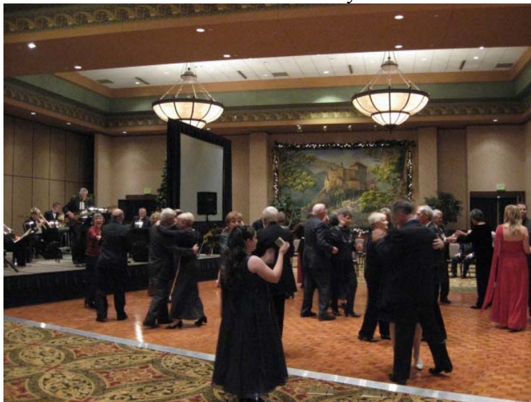
Our guests were treated to music by the Moonlighters before and after dinner.