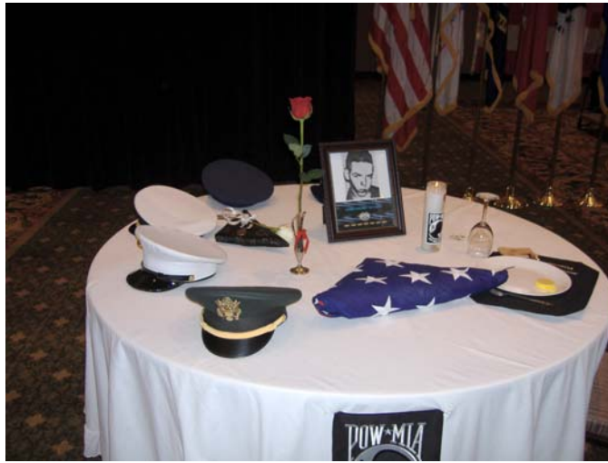
The POW/MIA table is set for our candlelight service.