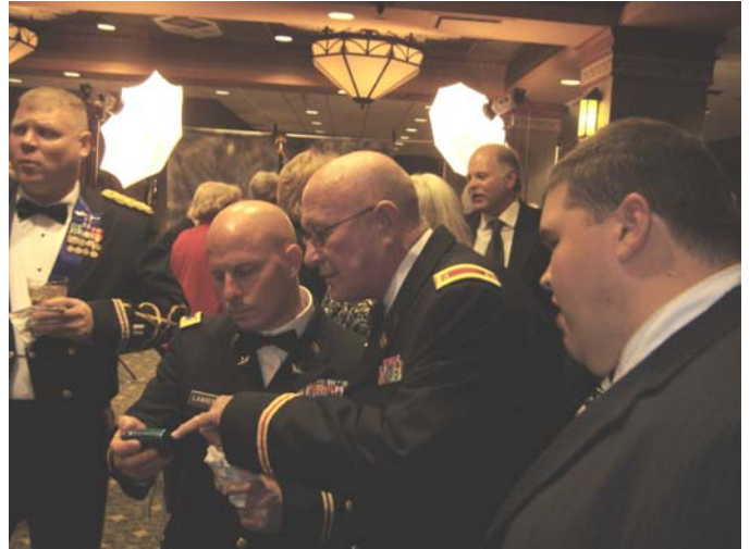
Some of our guests share memories.