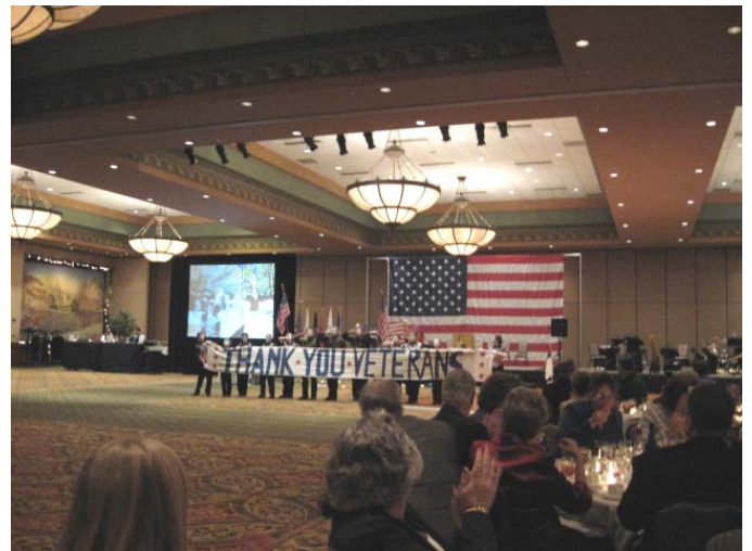
A beautiful message for our guests.