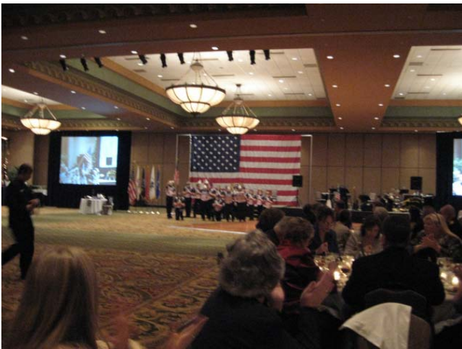
AIM International performs during dinner.