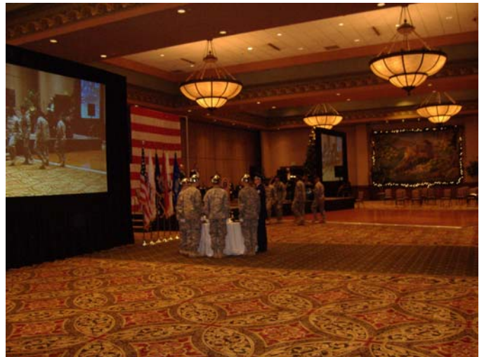
College of the Ozarks ROTC and JROTC Cadets perform the White Table POW/MIA service.