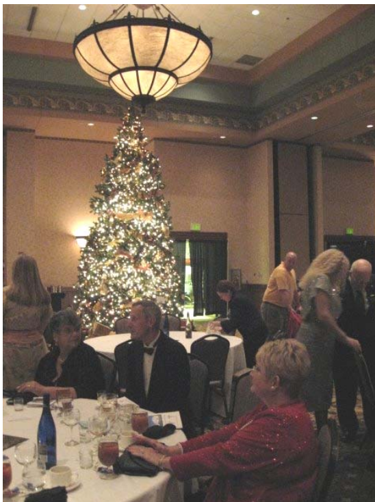
Elegant Christmas trees graced the hall.